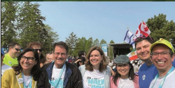
Joining friends at the annual UJA Walk for Israel event