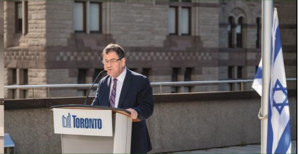
Giving a speech during the annual Israel Flag Raising Ceremony in celebration of Yom Haatzmaut at City Hall