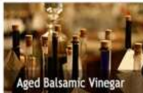
Aged Balsamic Vinegar