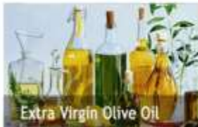
Extra Virgin Olive Oil